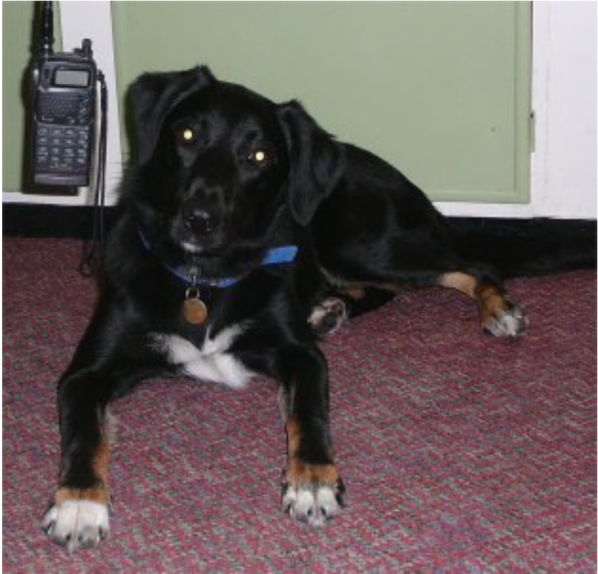
(Above) 'The lady dressed in black' BE\LLA always ready to QSO

Please send contributions for the May edition of HARCNEWS to the editor by 16th April. Items received after the deadline will be held over until a later edition.