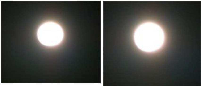
(Above) Moon at 2058 UTC

The only problem of course is that the size of the Moon image is very small! The best way to resolve this is to magnify the image by modifying the webcam. A project for next time! There will be another lunar eclipse 28 August 2007. Now enjoy the photos!