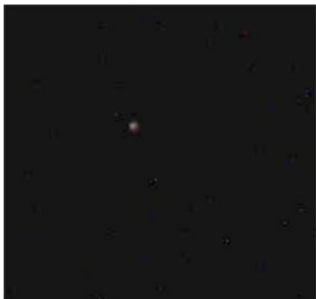
(Top) Moon at 2058 UTC